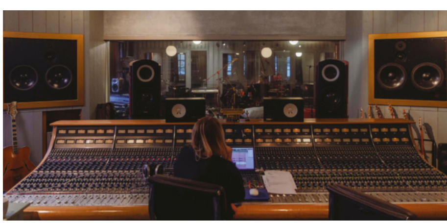
Poignantly for Benny and co, Riksmixningsverket's visitors have included Eurovision winner Loreen